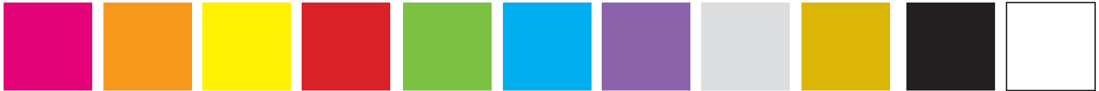
pink orange yellow red green blue purple silver gold black white