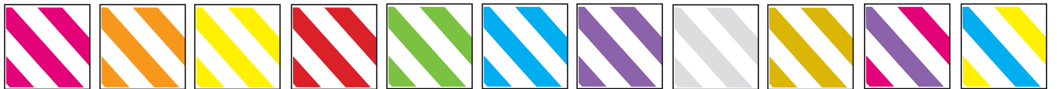
pink stripe orange stripe yellow stripe red stripe green stripe blue stripe purple stripe silver stripe gold stripe lilac/pink stripe yellow/blue stripe